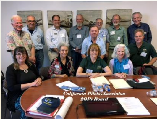
California Pilots Association 2018 Board