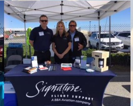
Signature FLIGHT SUPPORT A BBA Aviation company