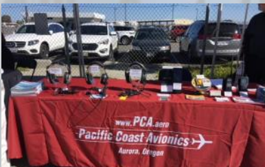
www.PCA.org Pacific Coast Avionics Aurora, Oregon