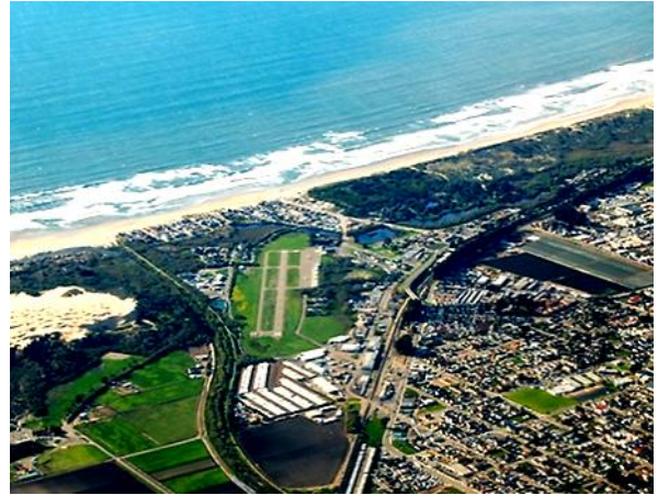
Automated Weather Observing System (AWOS)

The AWOS-3 will be a major asset to all pilots at Oceano County Airport due to the airport's vicinity to the coastline at Oceano Beach, CA. Pilots will be able to receive a computer-generated voice message which is broadcast via radio frequency to pilots in the vicinity of the airport. The message is updated at least once per minute. This will be a great benefit to departing and arriving aircraft at Oceano County Airport due to the possibility of developing weather including winds, marine layer, stratus clouds, or fog.