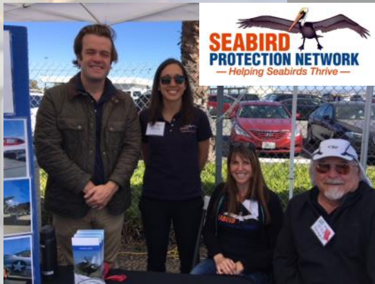
SEABIRD PROTECTION NETWORK — Helping Seabirds Thrive —