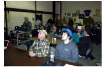
EAA Meeting Jan 13, 2011