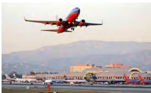
Southwest Airlines tested a new John Wayne Airport flight path for the FAA in January after Newport Beach-area residents complained about increased jet noise.