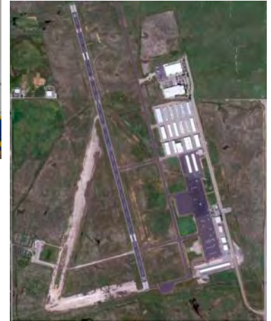
Lincoln Field (LHM)