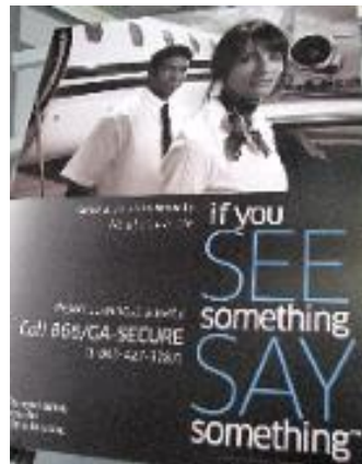
"If You See Something Say Something" DHS Campaign

a GA aircraft will be simplified. Starting Sept. 1, pilots will be able to file a single manifest to meet both the TSA requirements and those of Customs and Border Protection. Officials from both AOPA and NBAA were quoted in a DHS news release as encouraged by the changes. "This decision