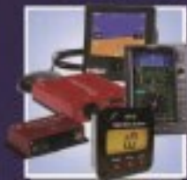
GPS / AVIONICS

AIRCRAFT PARTS • PILOT SUPPLIES • AVIONICS