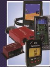
GPS / AVIONICS

AIRCRAFT PARTS • PILOT SUPPLIES • AVIONICS